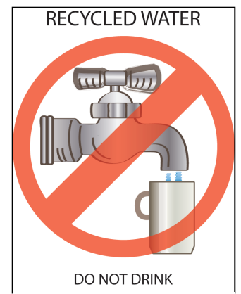
Figure 2. Post signs in the language understandable by all employees.